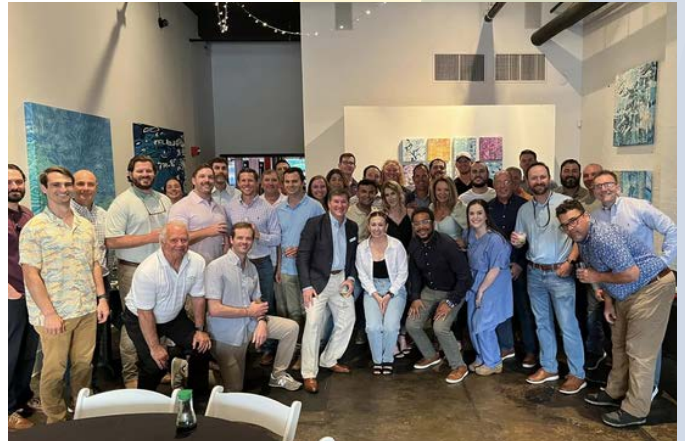
Tsunami Sushi in Lafayette