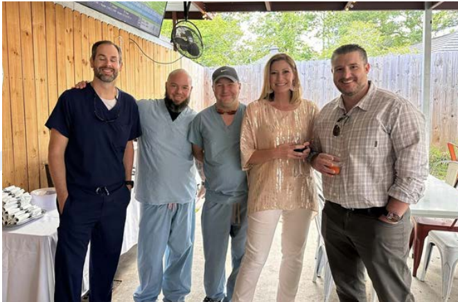
BRQ in Baton Rouge

This year LANA held four Regional Updates across the State. since the spring LANA has held regional updates in Shreveport, Baton Rouge, Lafayette, and New Orleans. These events were a huge success and we hosted over 30 CRNA's at each event. These Regional Updates allow CRNA's to hear updates from their local board members, and mingle with other CRNA's.